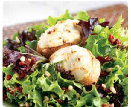
Arcadian Harvest® Goat Cheese Crostini Salad