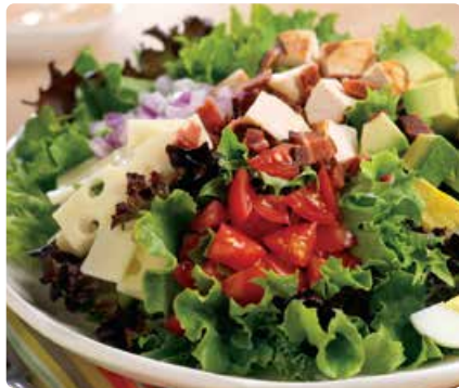
Arcadian Harvest® Cobb Salad