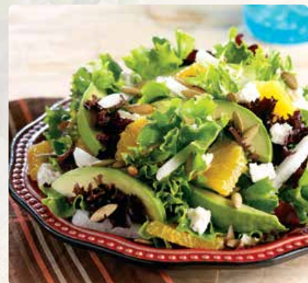
Mexican Summer Salad

Farm fresh from Mann’s - the family who brought you Broccolini®